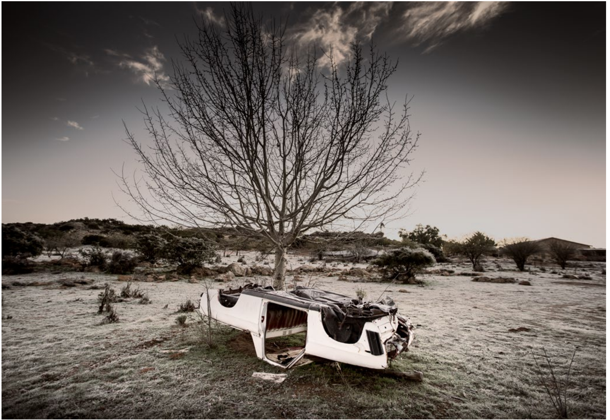
ABANDONED # 26 | Liefiefontein - South Africa 60 x 77cm | 80 x 110cm