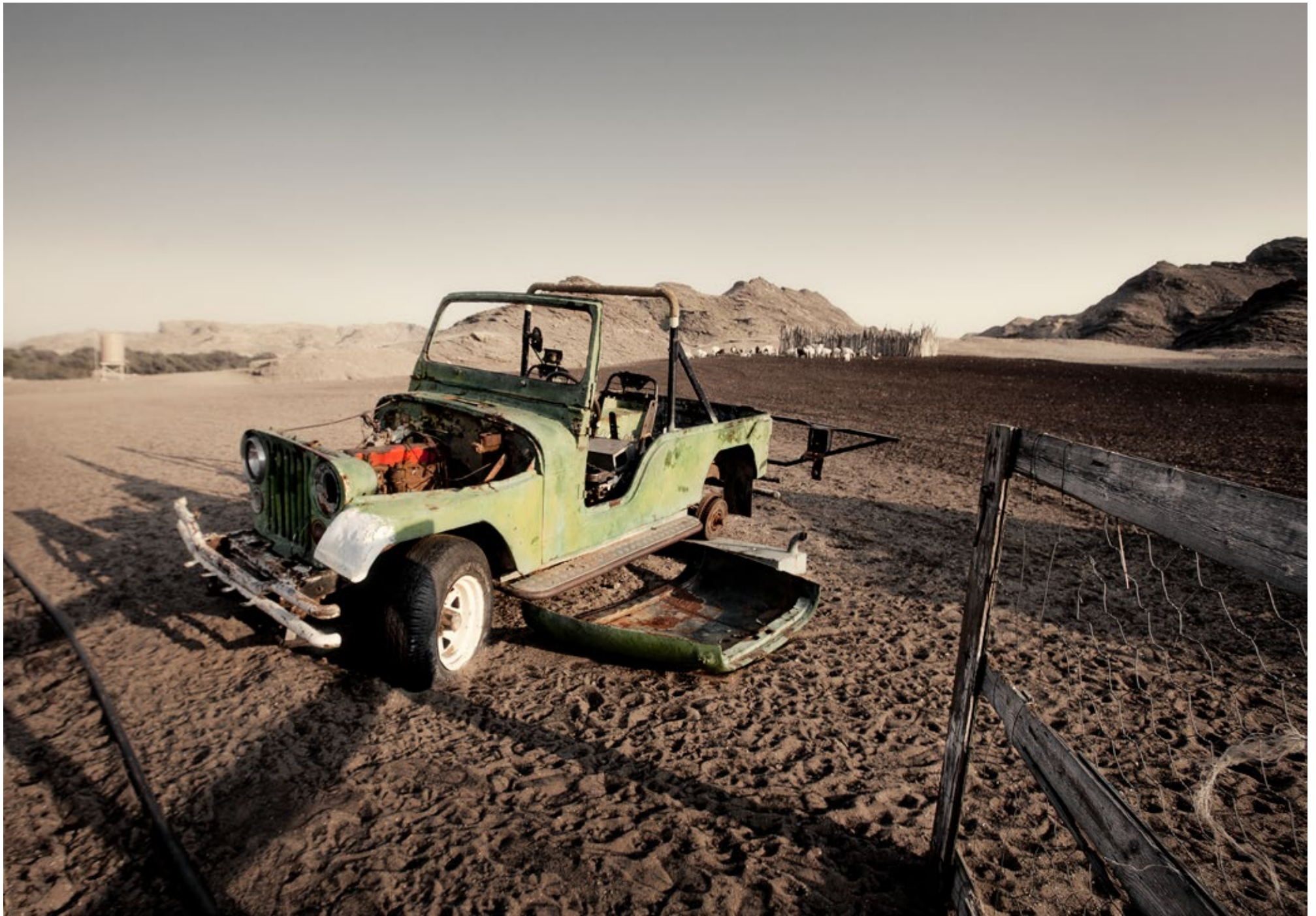
ABANDONED # 15 | Naukluft Park - Namibia 60 x 77cm | 80 x 110cm