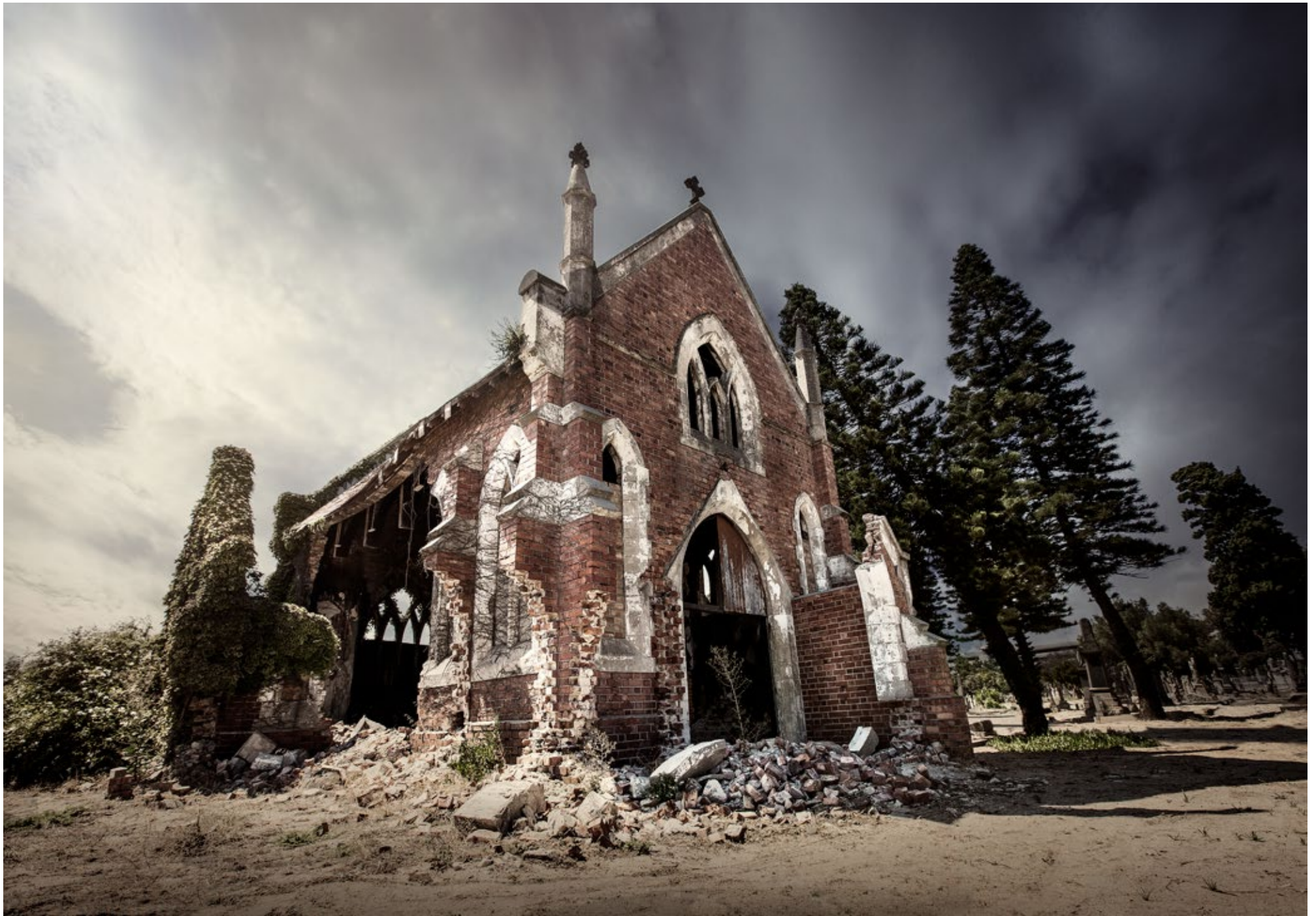
ABANDONED # 30 | Cape Town - South Africa 60 x 77cm | 80 x 110cm