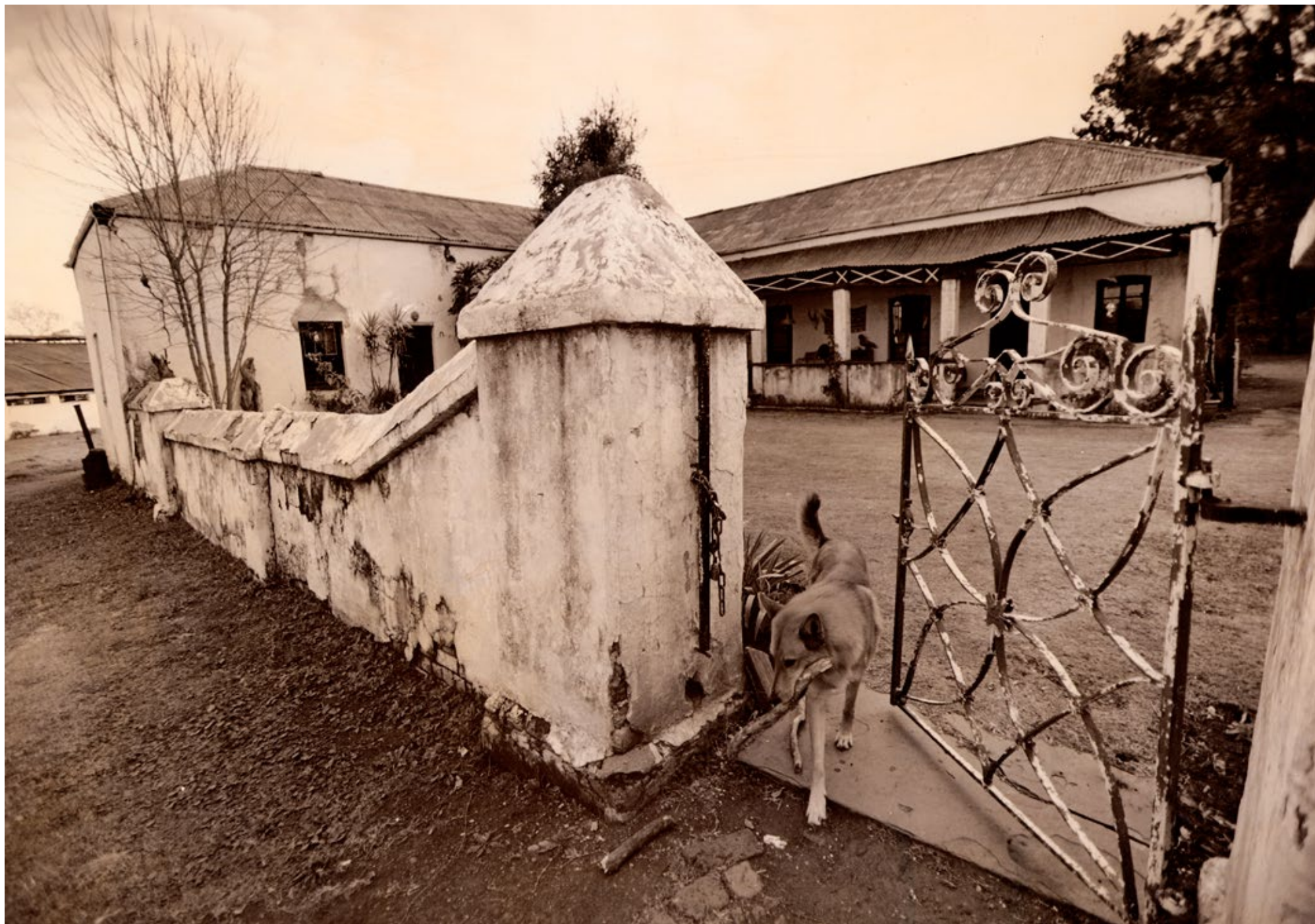
ABANDONED # 5 | Botchebelo - South Africa 60 x 77cm | 80 x 110cm