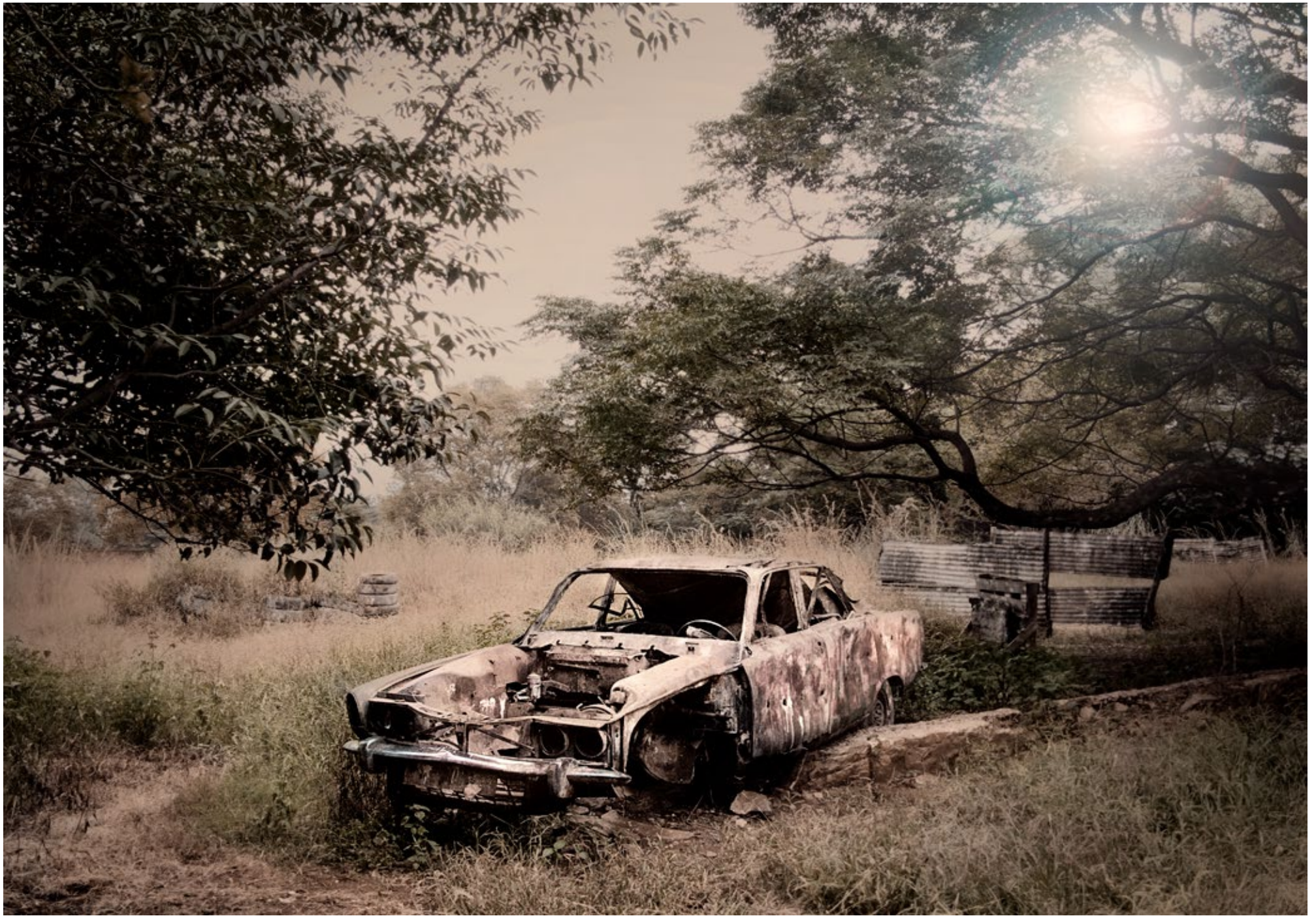
ABANDONED # 4 | Pretoria - South Africa 60 x 77cm | 80 x 110cm