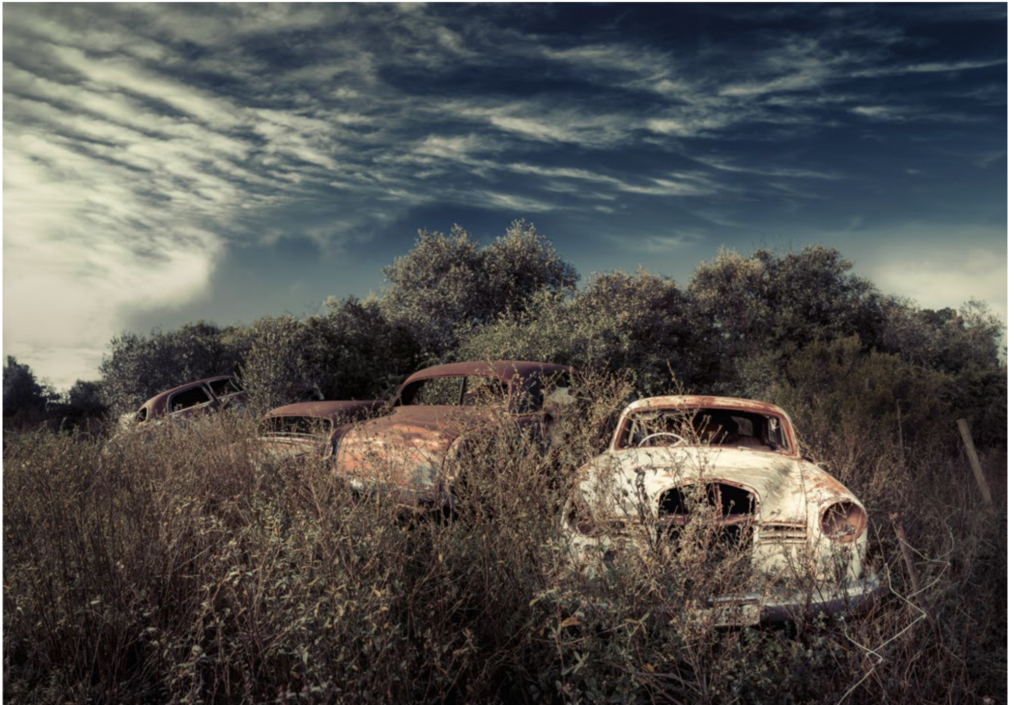
ABANDONED # 34 | Boesmans Pad - South Africa 60 x 77cm | 80 x 110cm