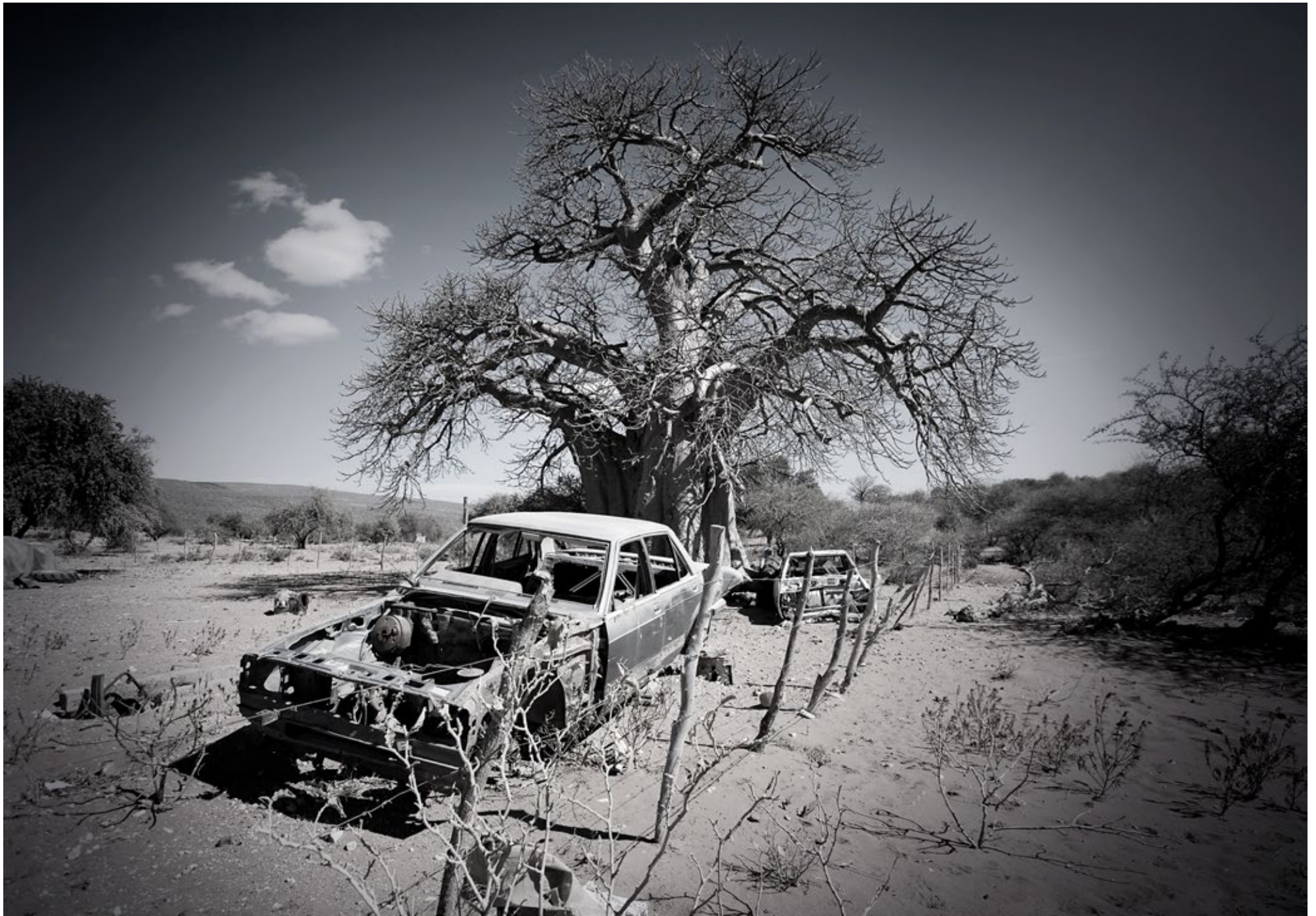
ABANDONED # 7 | Venda - South Africa 60 x 77cm | 80 x 110cm