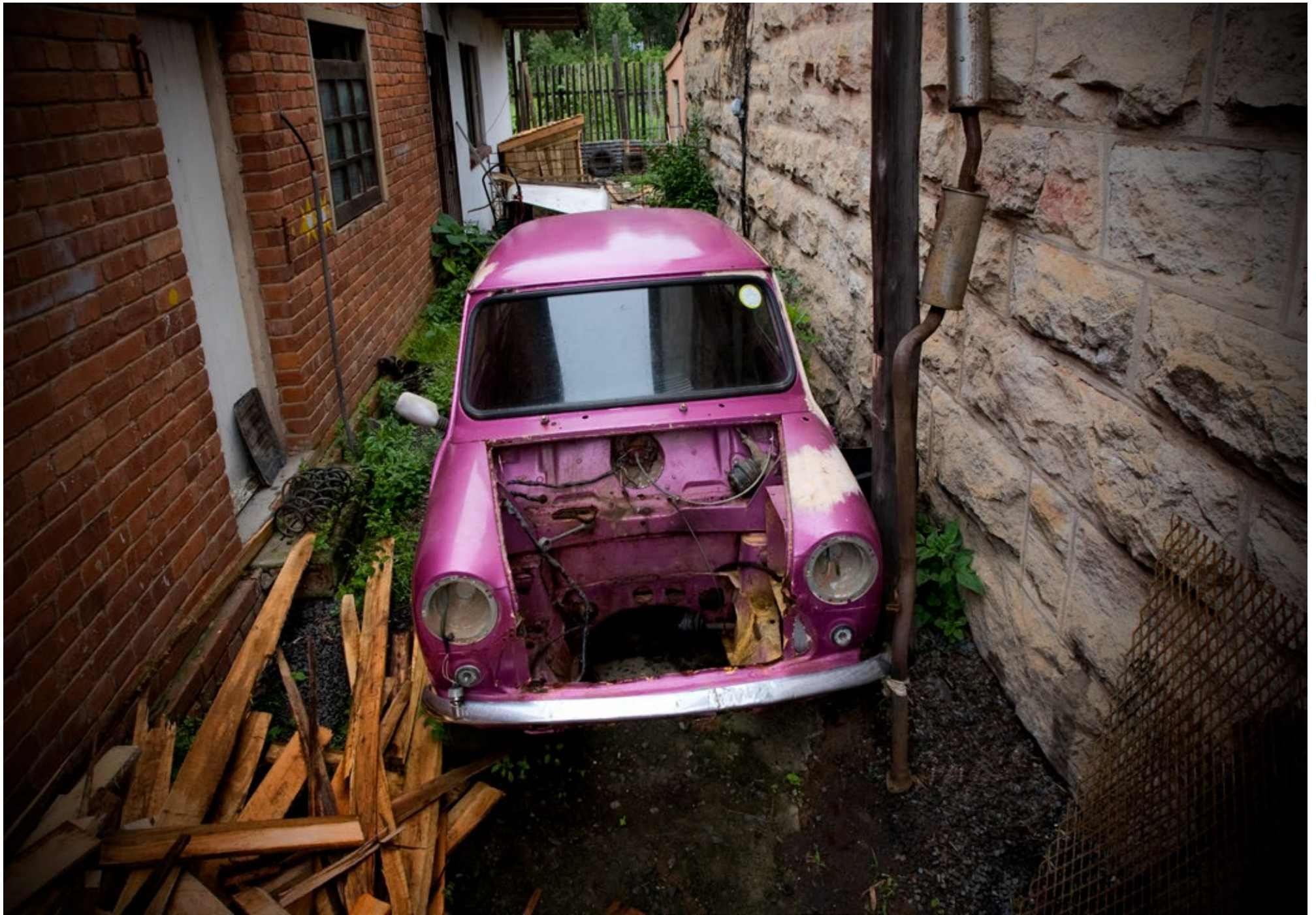
ABANDONED # 10 | Oribi Gorge - South Africa 60 x 77cm | 80 x 110cm