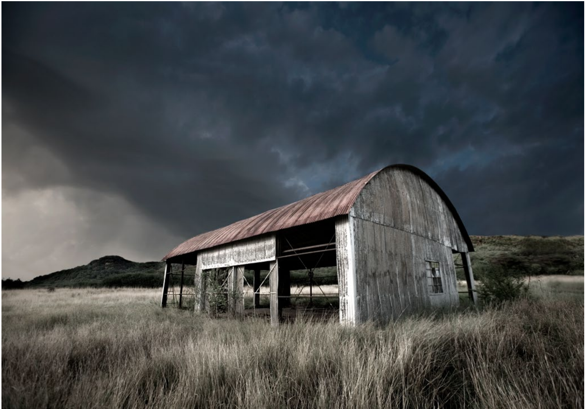
ABANDONED # 12 | North West Province - South Africa 60 x 77cm | 80 x 110cm