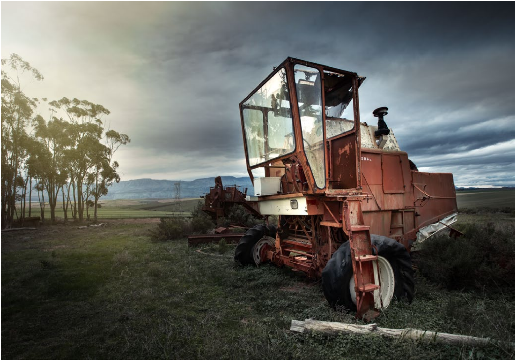
ABANDONED # 40 | Overberg - South Africa 60 x 77cm | 80 x 110cm