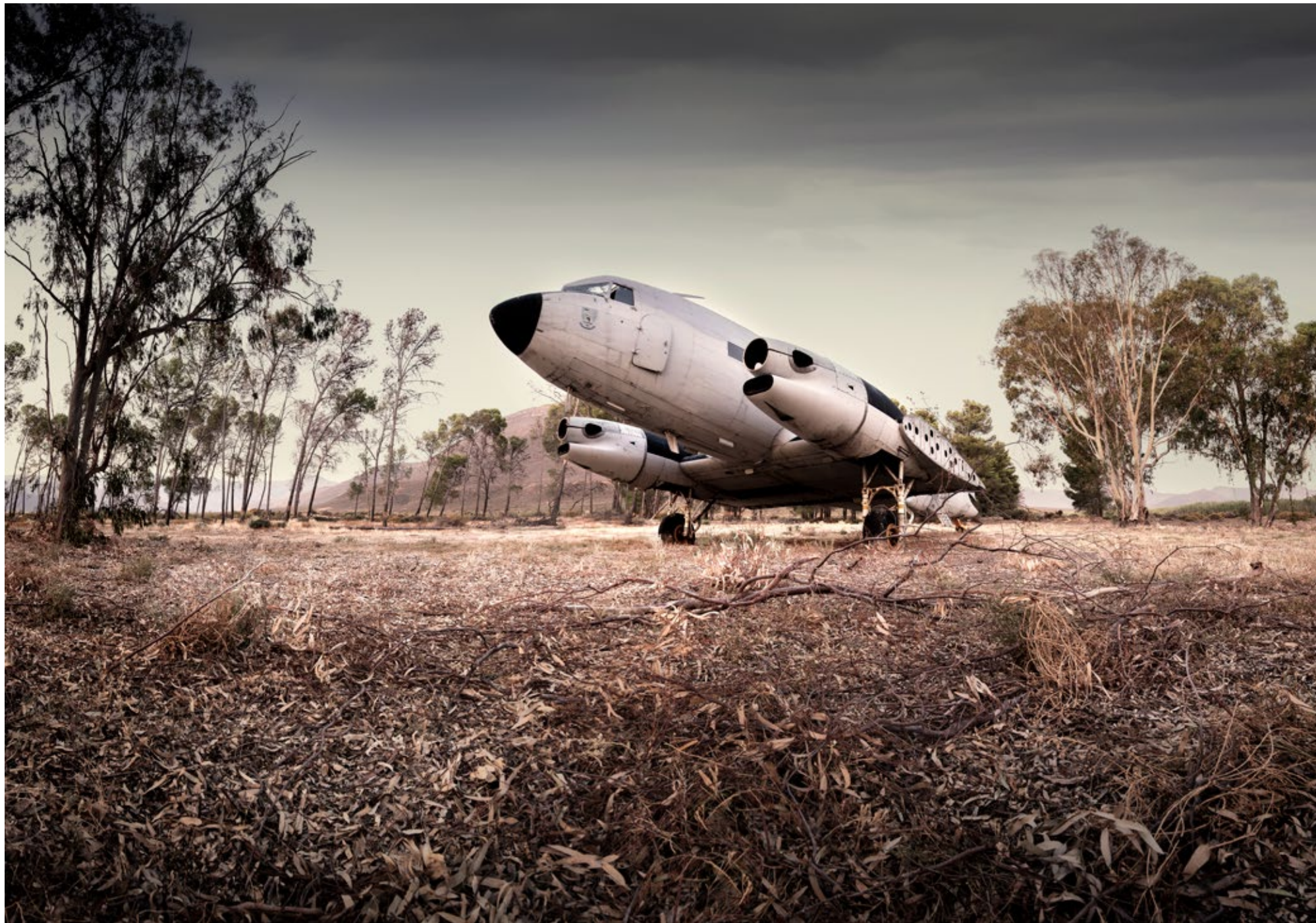
ABANDONED # 29 | Bokkerivier - South Africa 60 x 77cm | 80 x 110cm