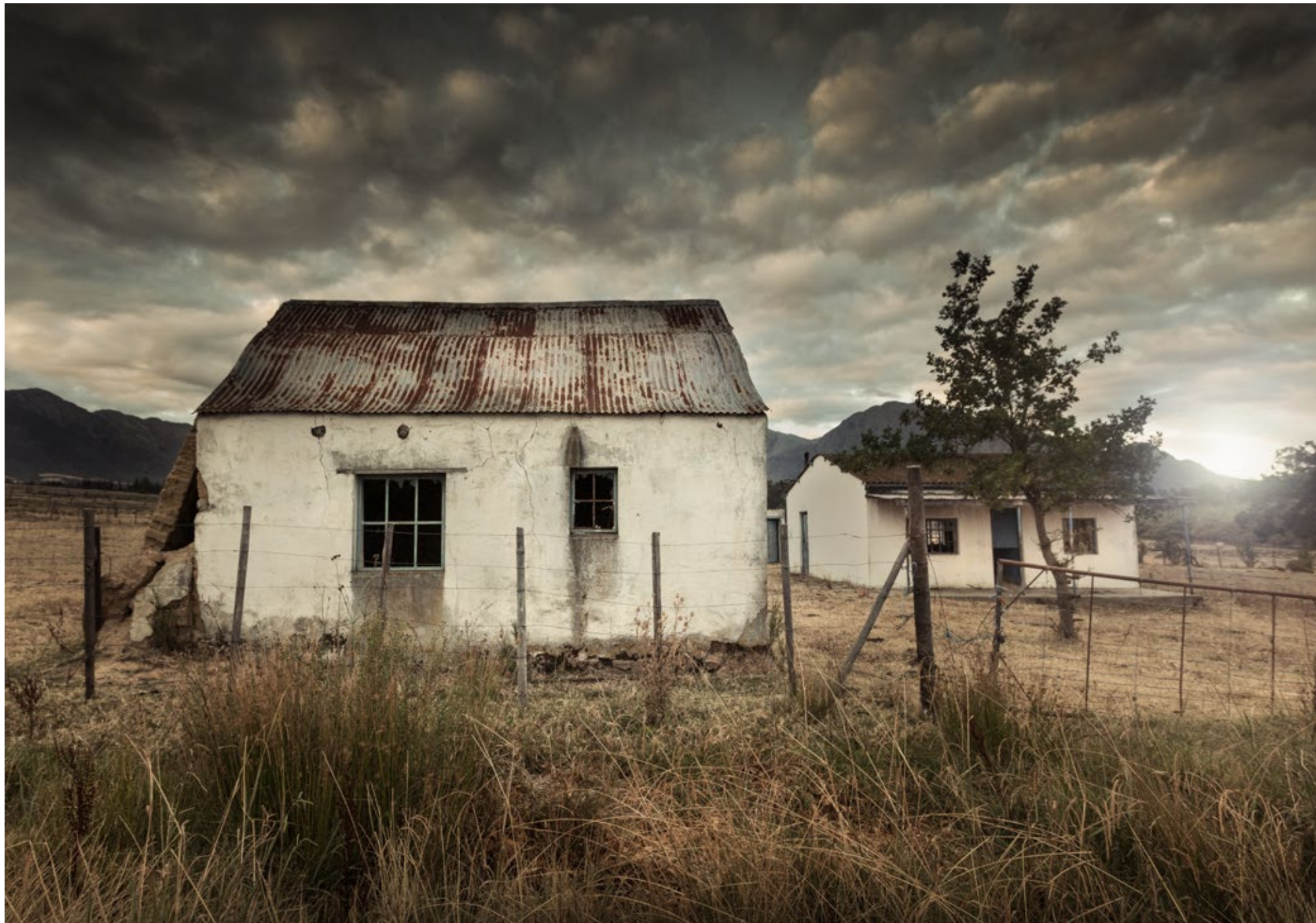
ABANDONED # 33 | Tulbagh - South Africa 60 x 77cm | 80 x 110cm