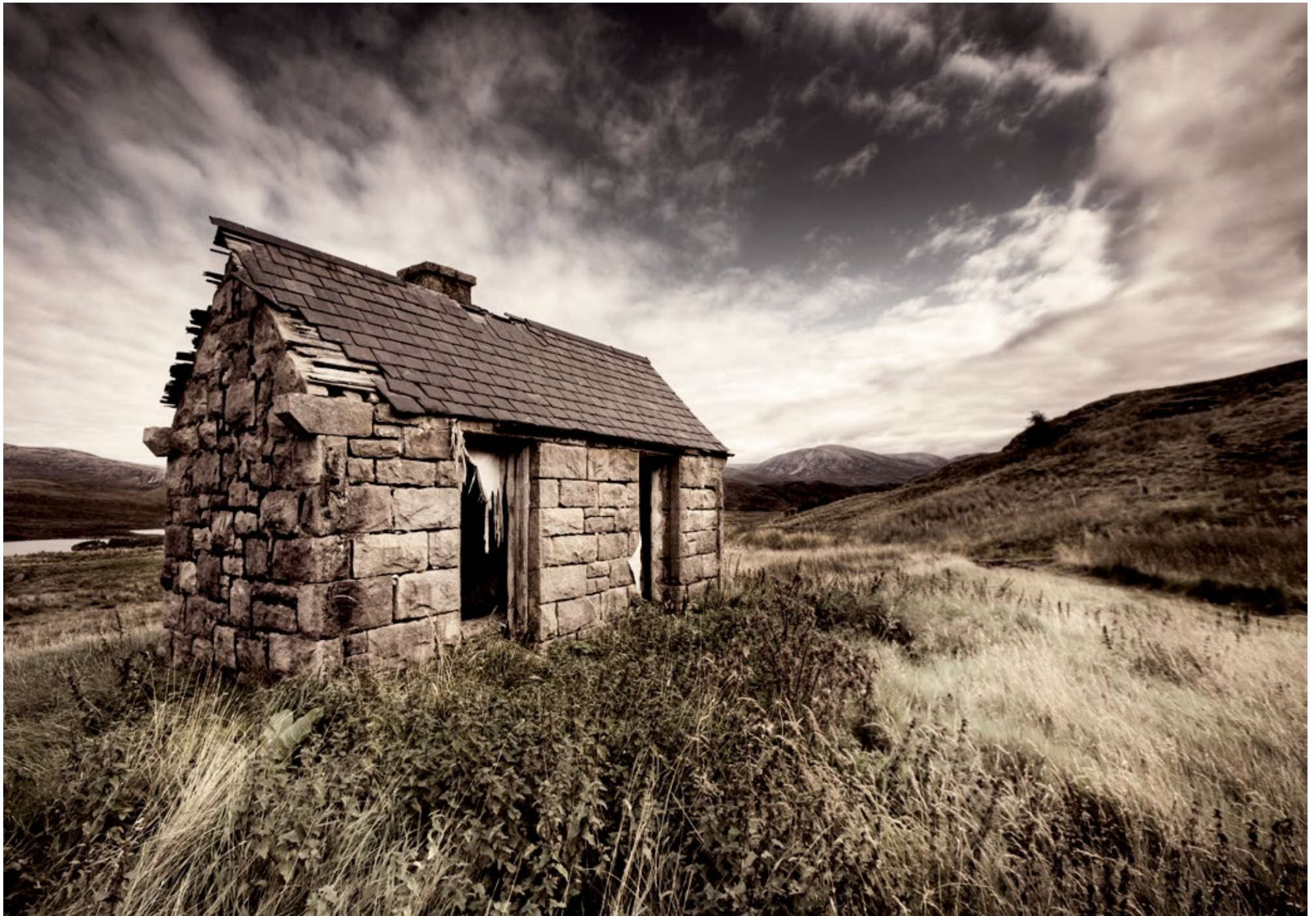
ABANDONED # 16 | Drumrunie - Scotland 60 x 77cm | 80 x 110cm