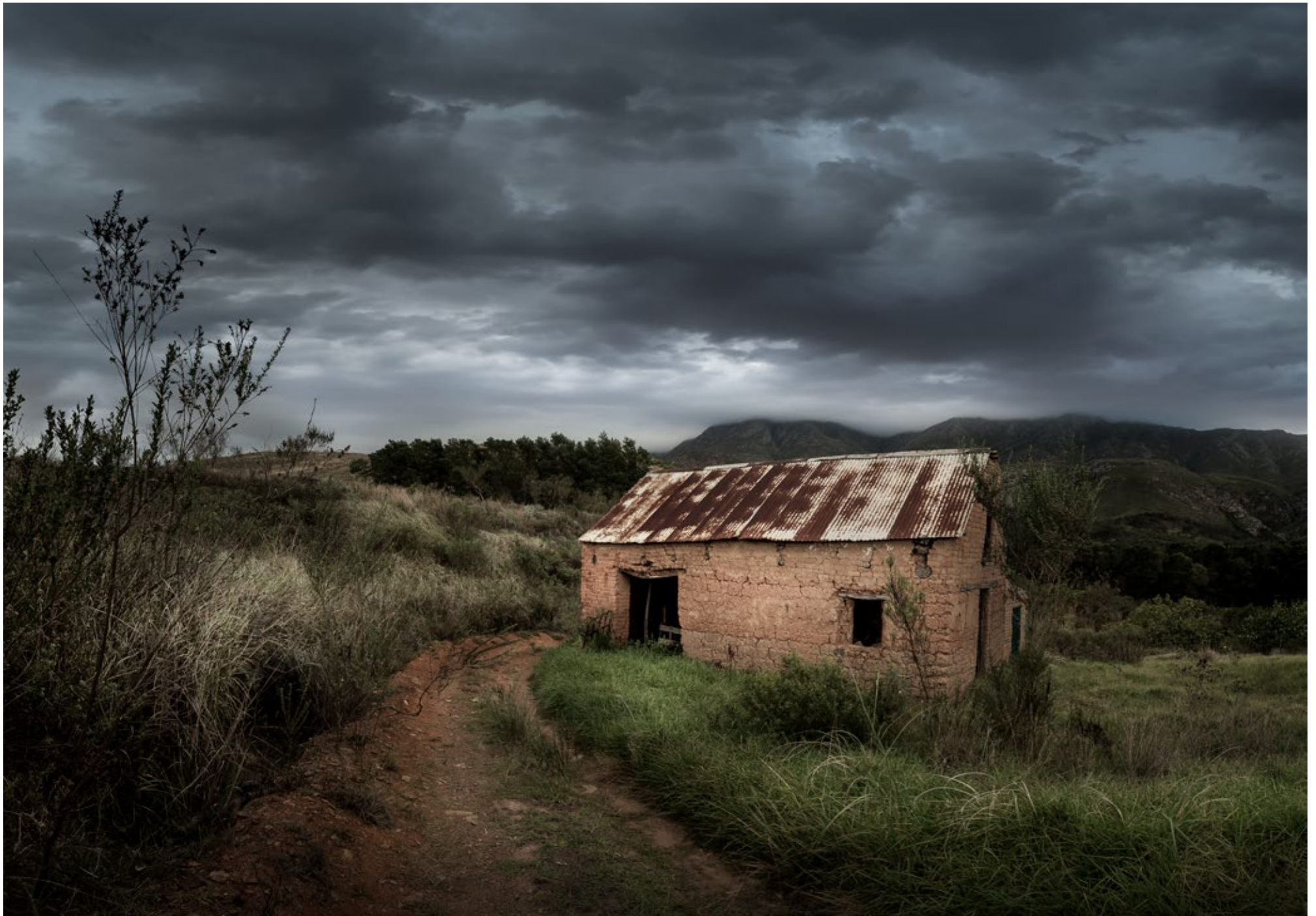
ABANDONED # 35 | Leopards Creek - South Africa 60 x 77cm | 80 x 110cm