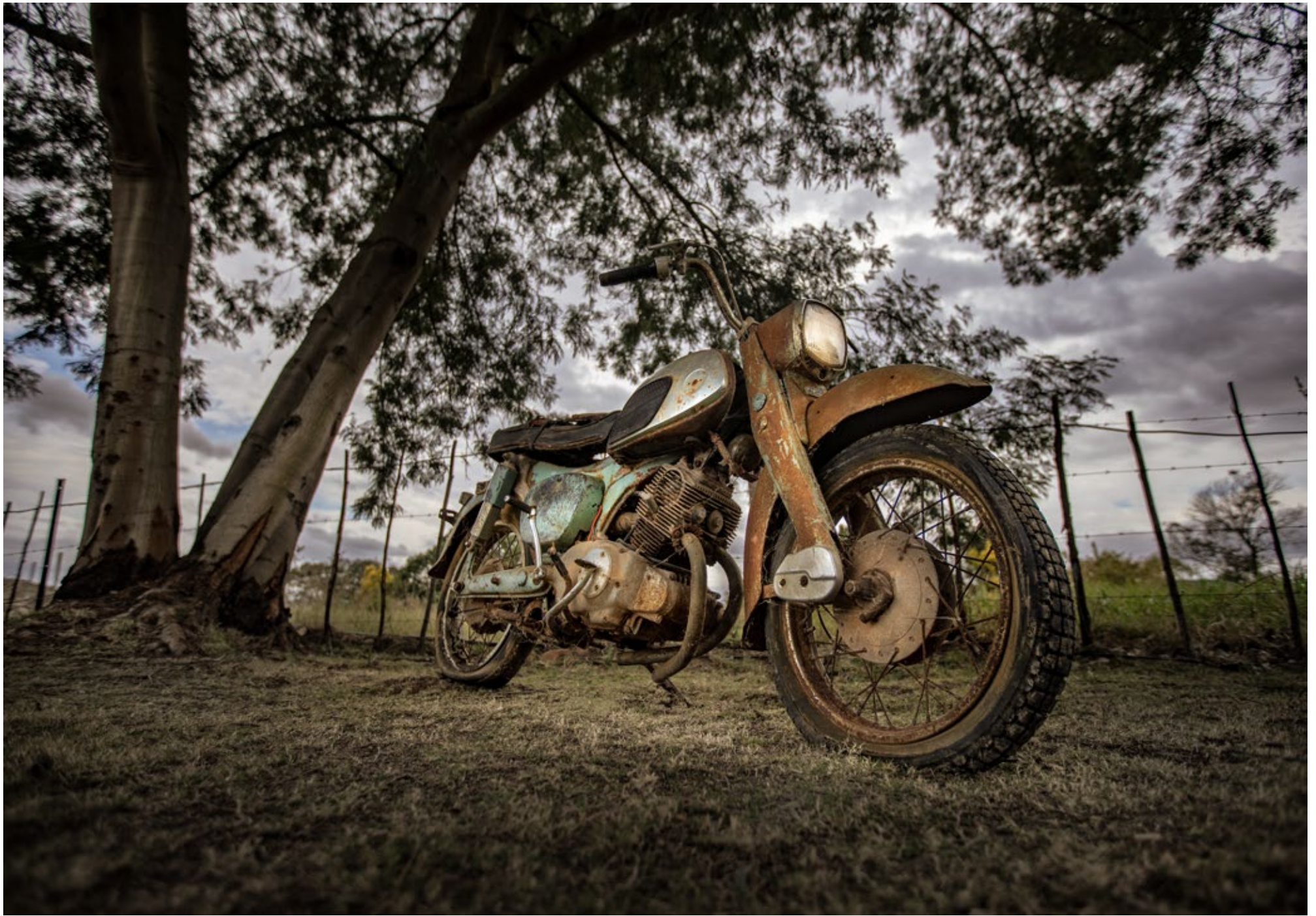
ABANDONED # 39 | Swellendam - South Africa 60 x 77cm | 80 x 110cm