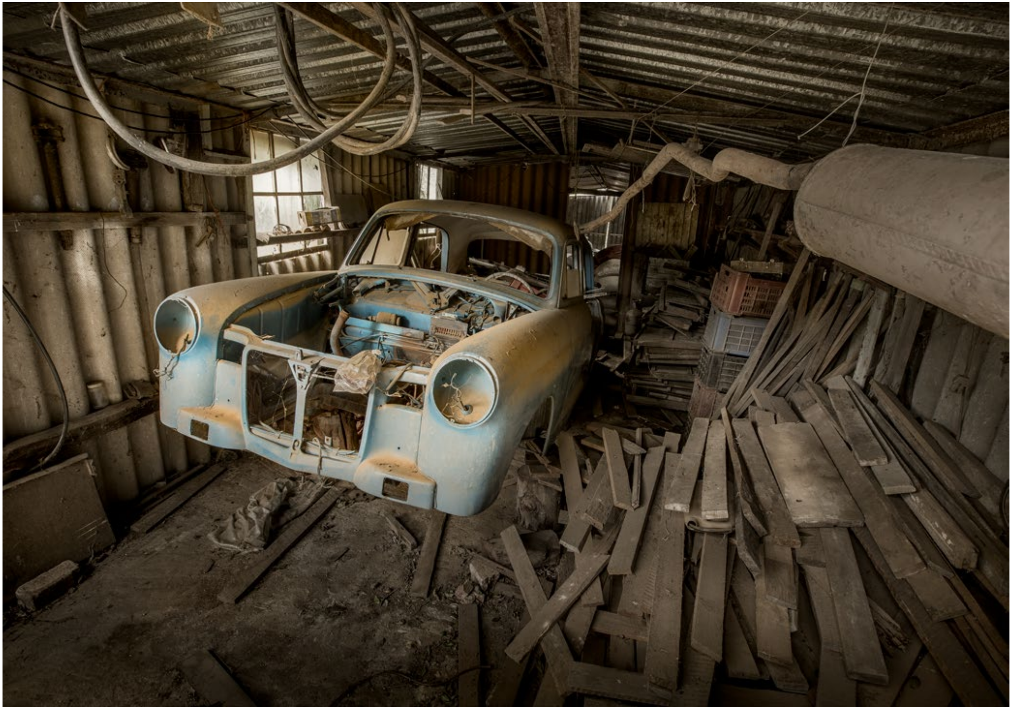
ABANDONED # 32 | Boesmanspad - South Africa 60 x 77cm | 80 x 110cm