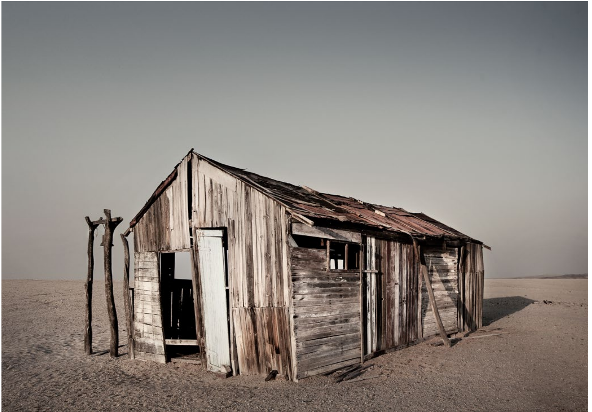
ABANDONED # 20 | Naukluft Park - Namibia 60 x 77cm | 80 x 110cm