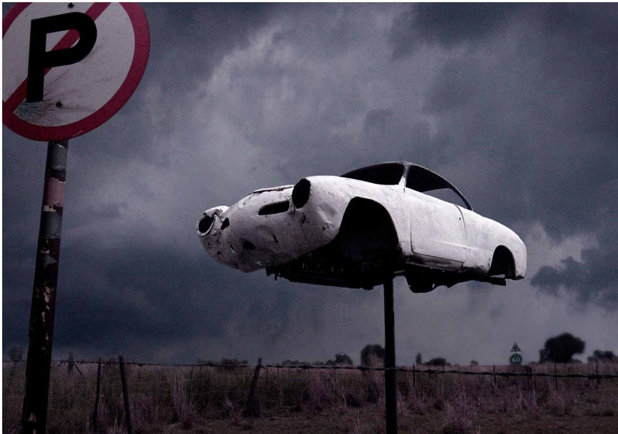
ABANDONED # 1 | Orange Free State - South Africa 60 x 77cm | 80 x 110cm