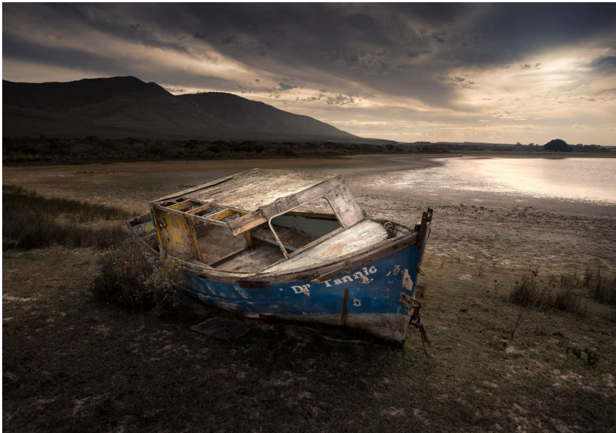
ABANDONED # 37 | Malgas - South Africa 60 x 77cm | 80 x 110cm