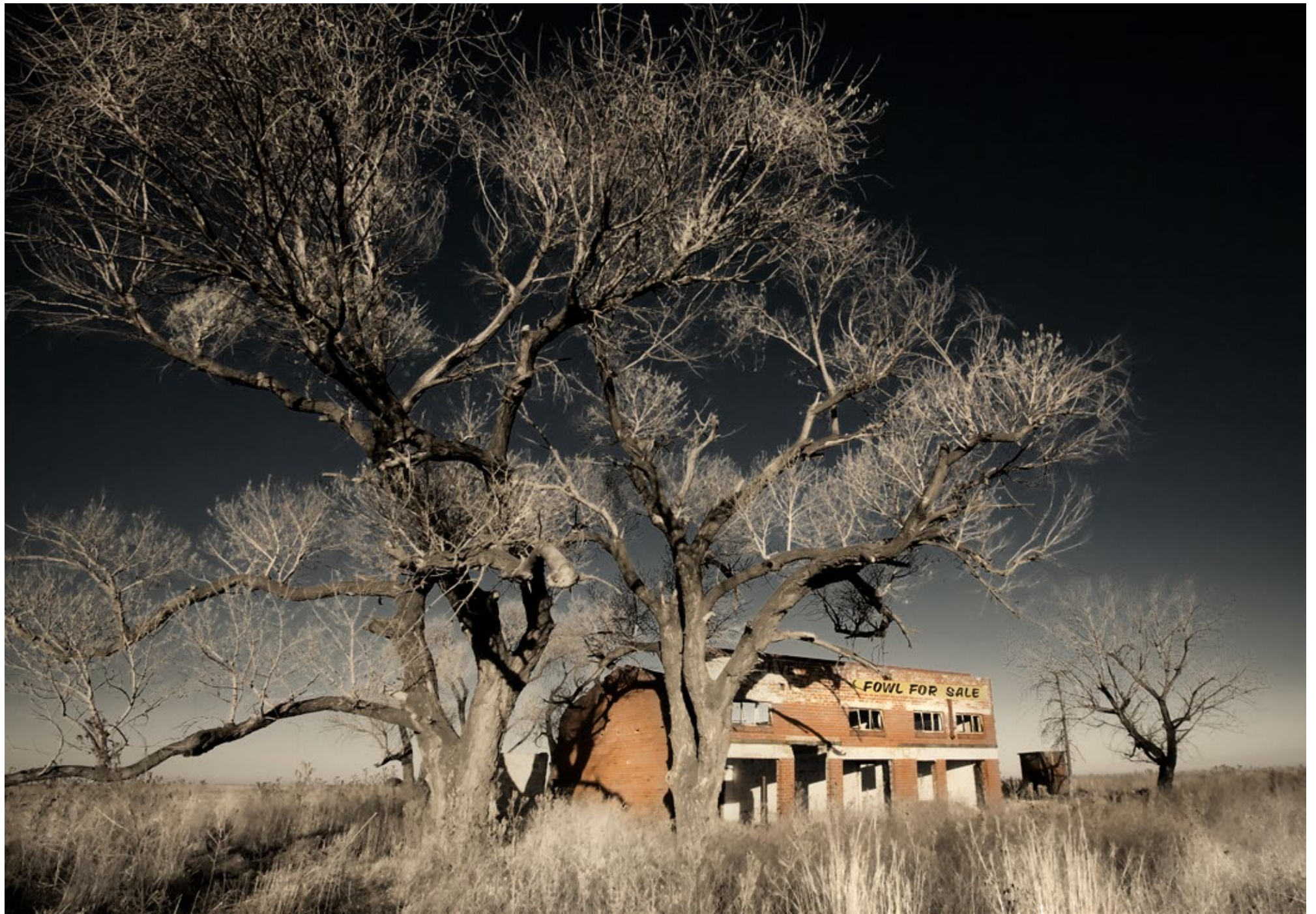
ABANDONED # 18 | Orange Free State - South Africa 60 x 77cm | 80 x 110cm