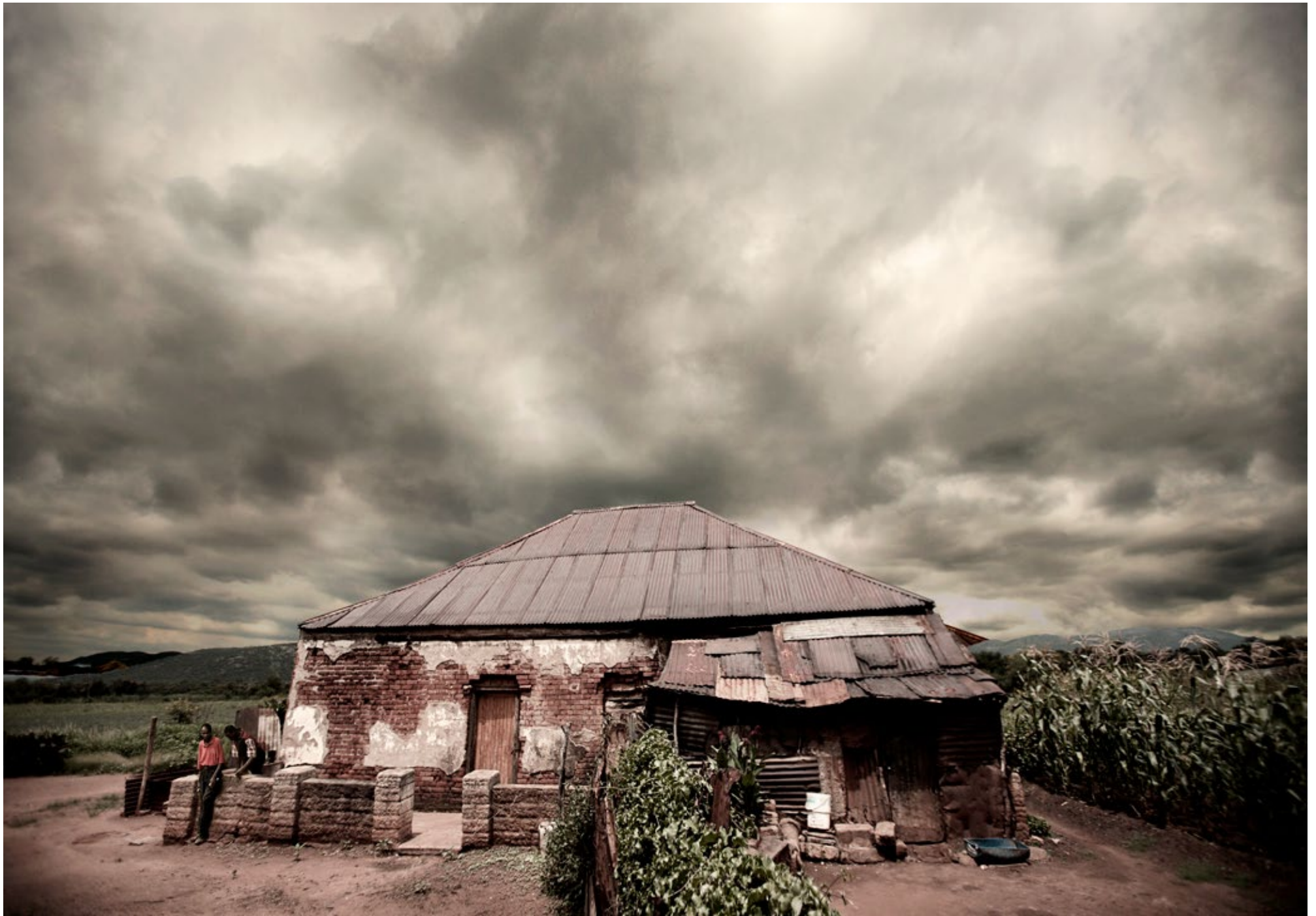
ABANDONED # 3 | North West Province - Brits - South Africa 60 x 77cm | 80 x 110cm