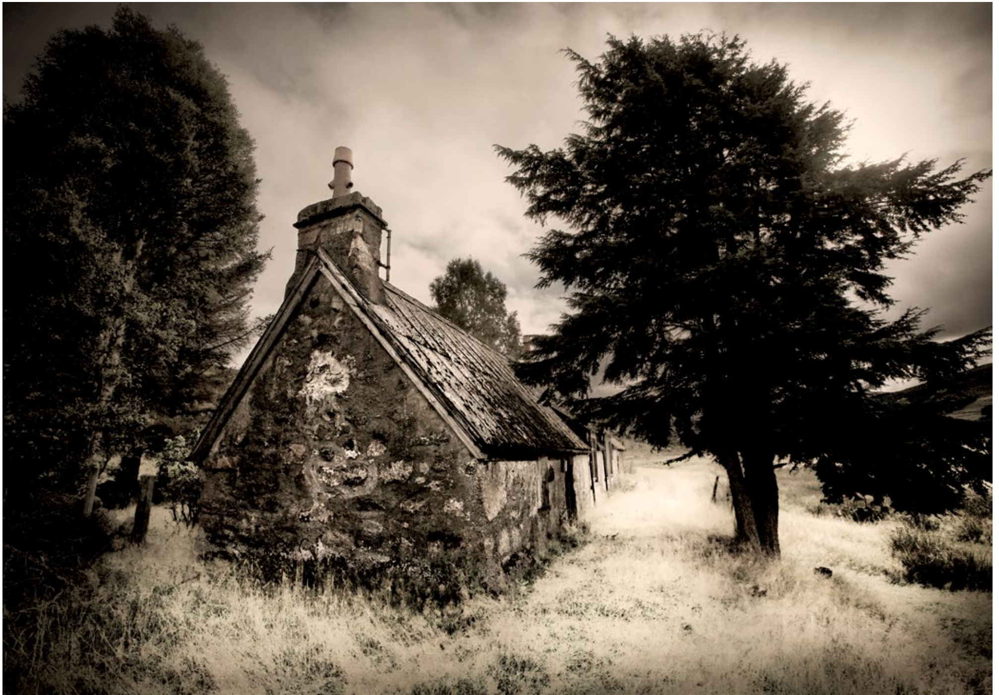
ABANDONED # 13 | Elphin - Scotland SOLD OUT