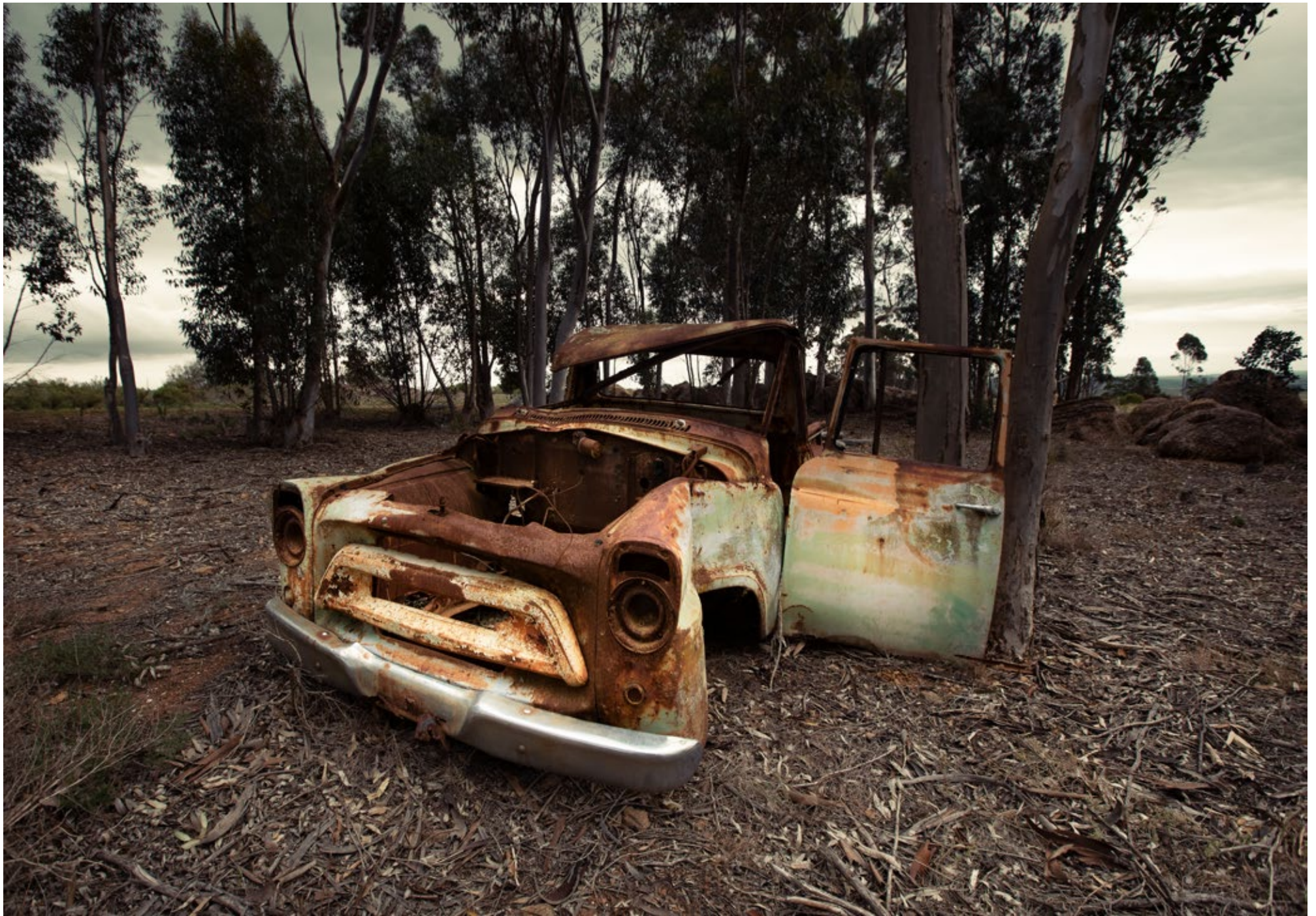
ABANDONED # 38 | Swellendam - South Africa 60 x 77cm | 80 x 110cm