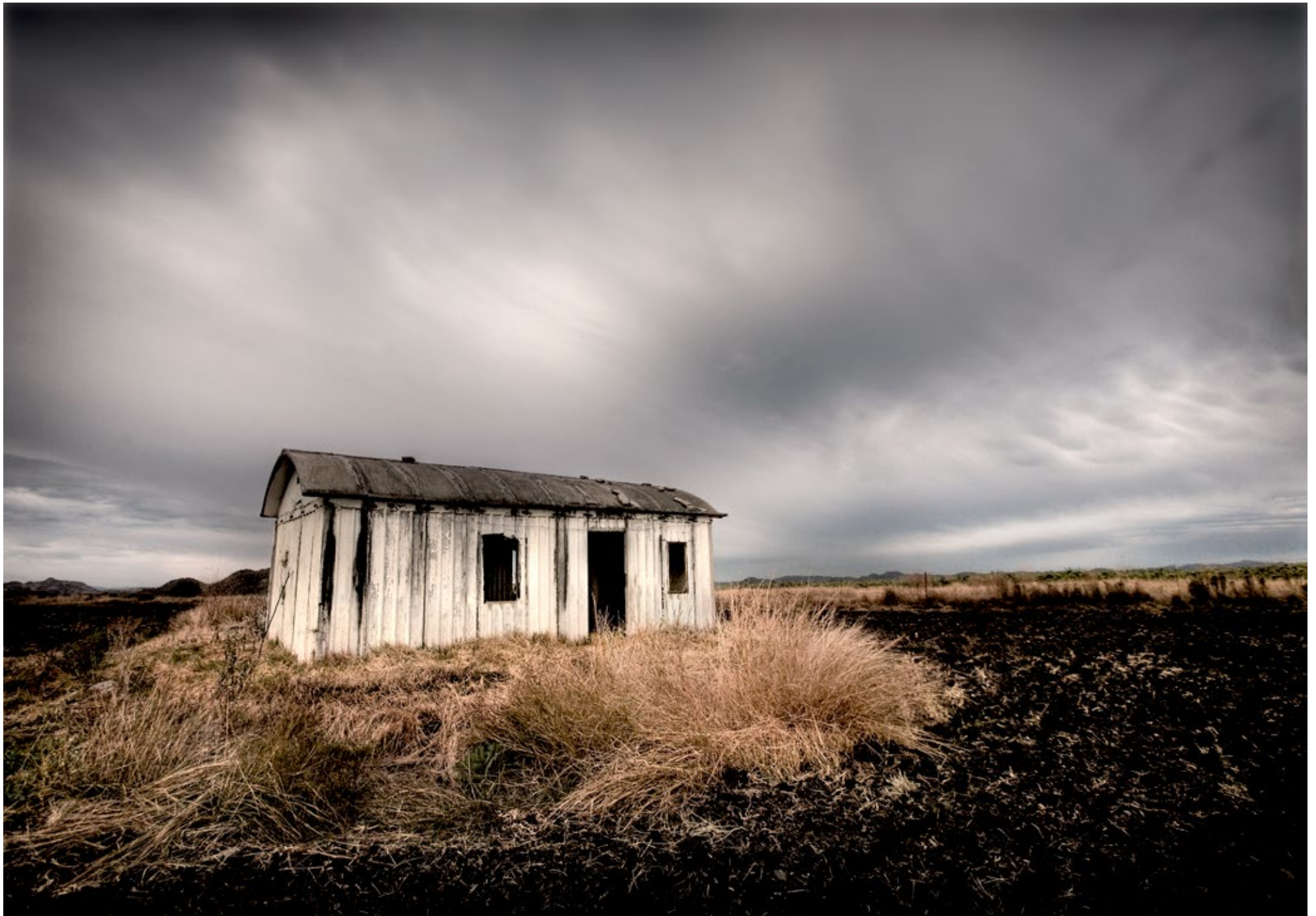
ABANDONED # 11 | North West Province - South Africa 60 x 77cm | 80 x 110cm