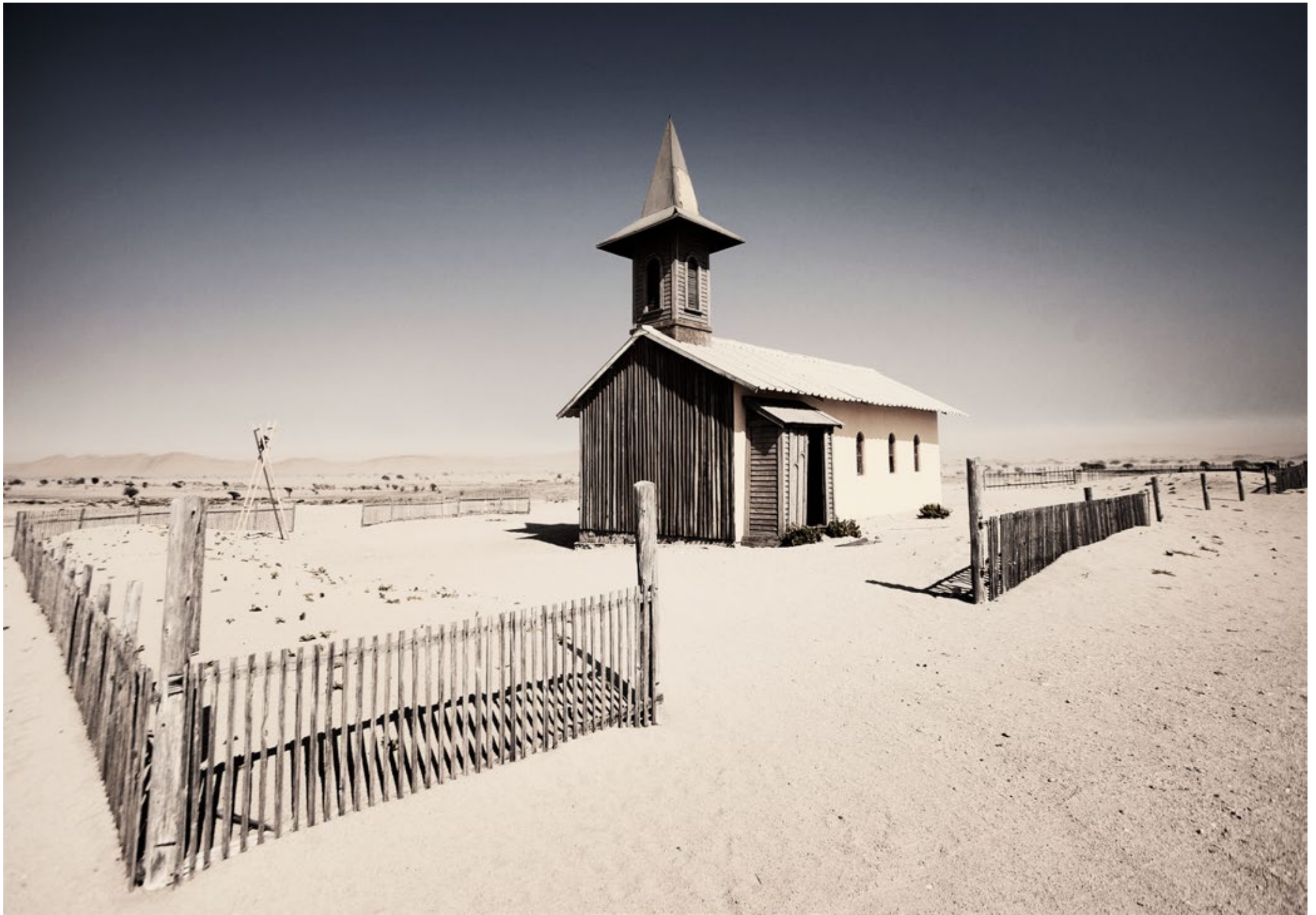
ABANDONED # 24 | Khomas Region - Namibia 60 x 77cm | 80 x 110cm