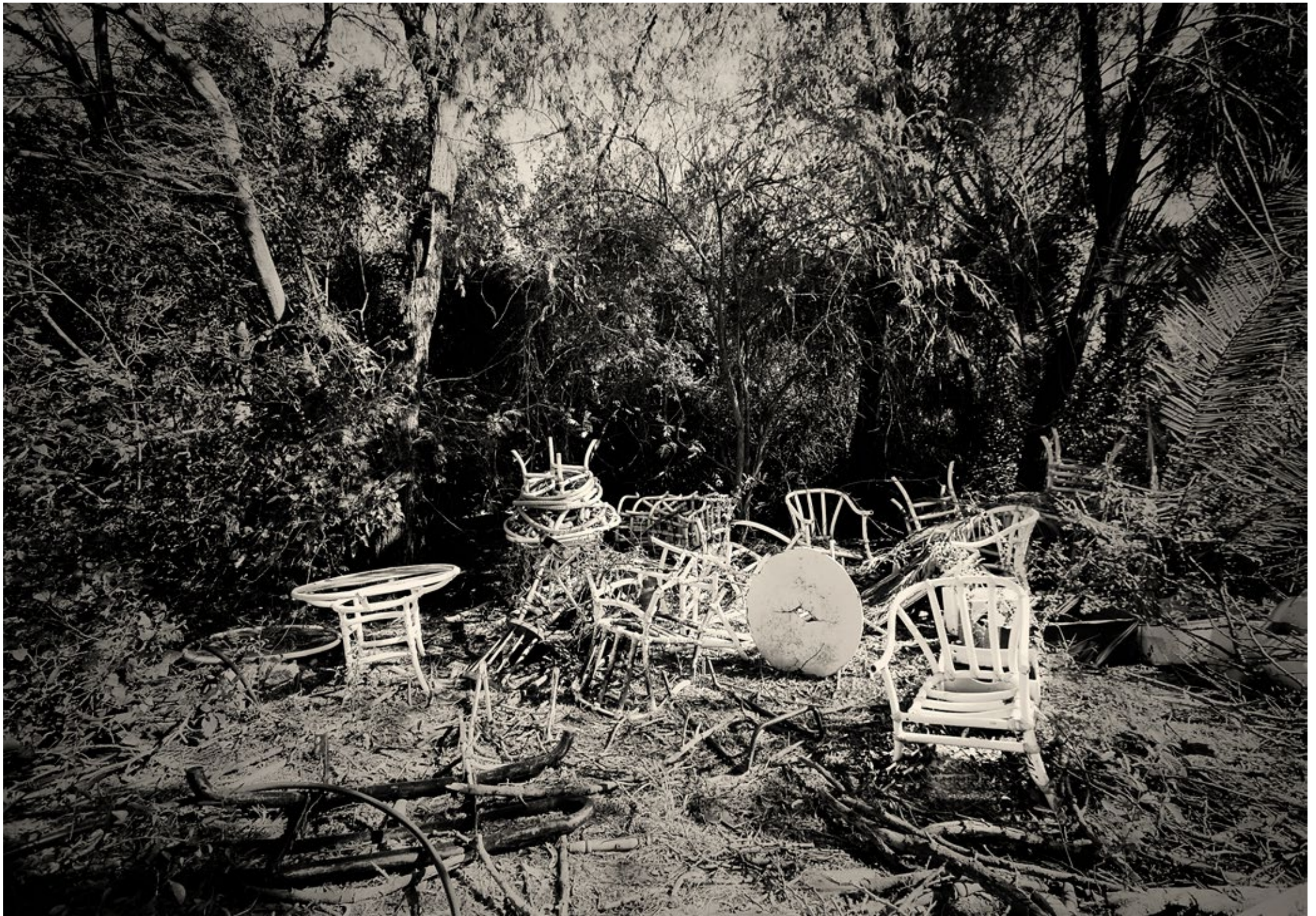
ABANDONED # 6 | Venda - South Africa SOLD OUT