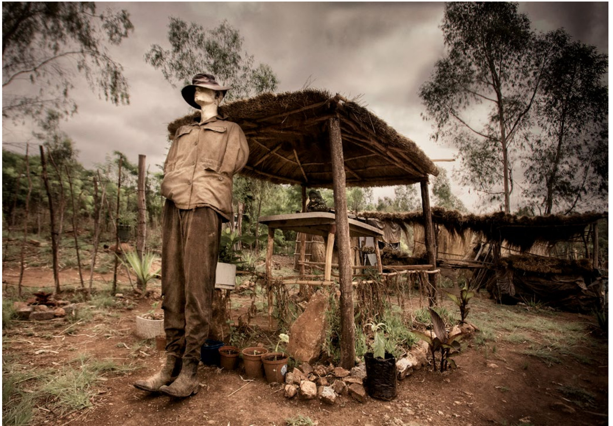
ABANDONED # 19 | Pretoria - South Africa 60 x 77cm | 80 x 110cm