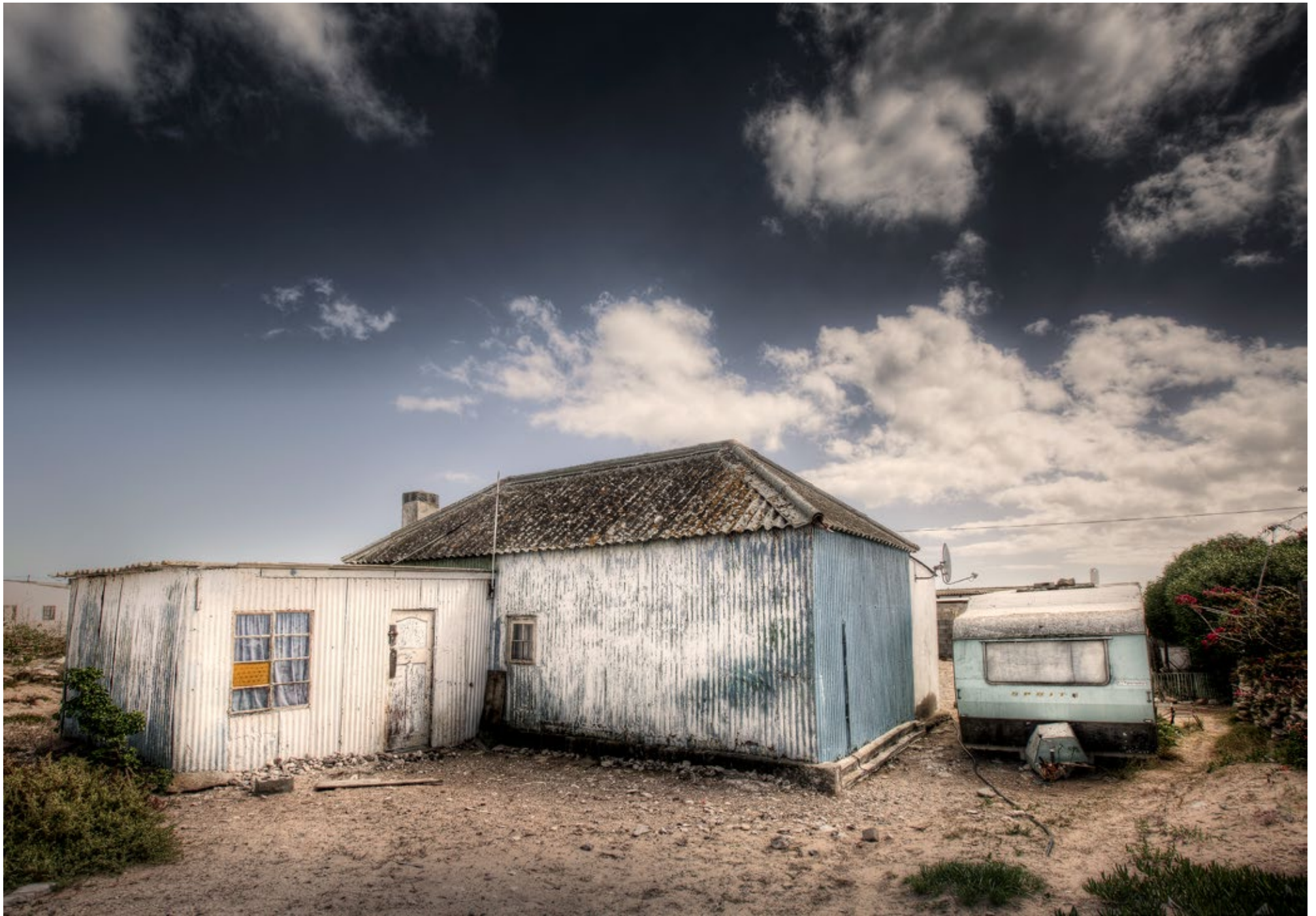
ABANDONED # 22 | Paternoster - South Africa 60 x 77cm | 80 x 110cm